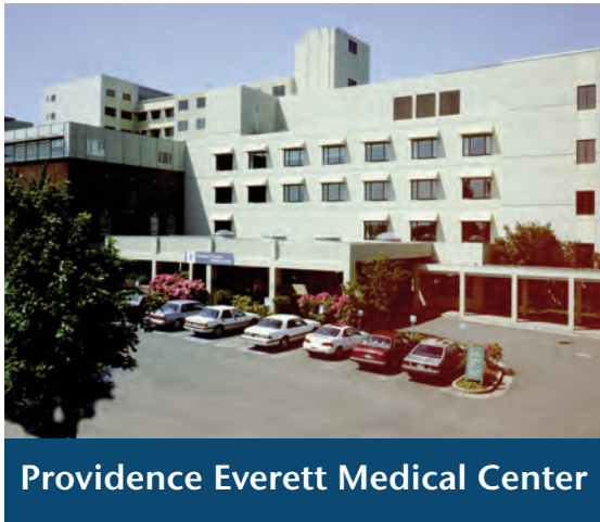
Providence Everett Medical Center

“[With CardioPACS] the doctors can retrieve onsite images immediately. For archived images, it takes about 45 seconds. Our storage facility is 40 miles away, so we think 40 miles in 45 seconds is pretty good.”